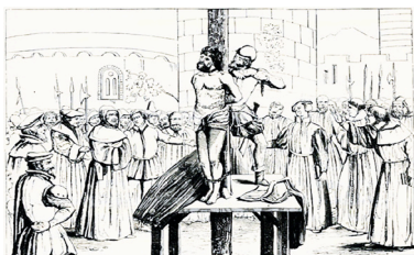
1536 Tyndale Strangled and Burned

William Tyndale was born in England in 1492. He wanted the common man to have the Bible in his own language. Tyndale was imprisoned for over a year before being choked to death and burned.